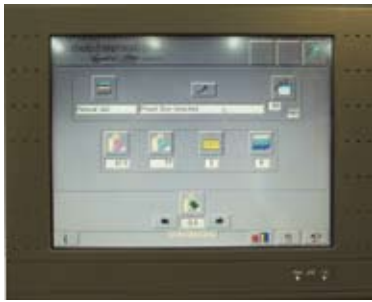
Touch Screen Controls for easy programming.