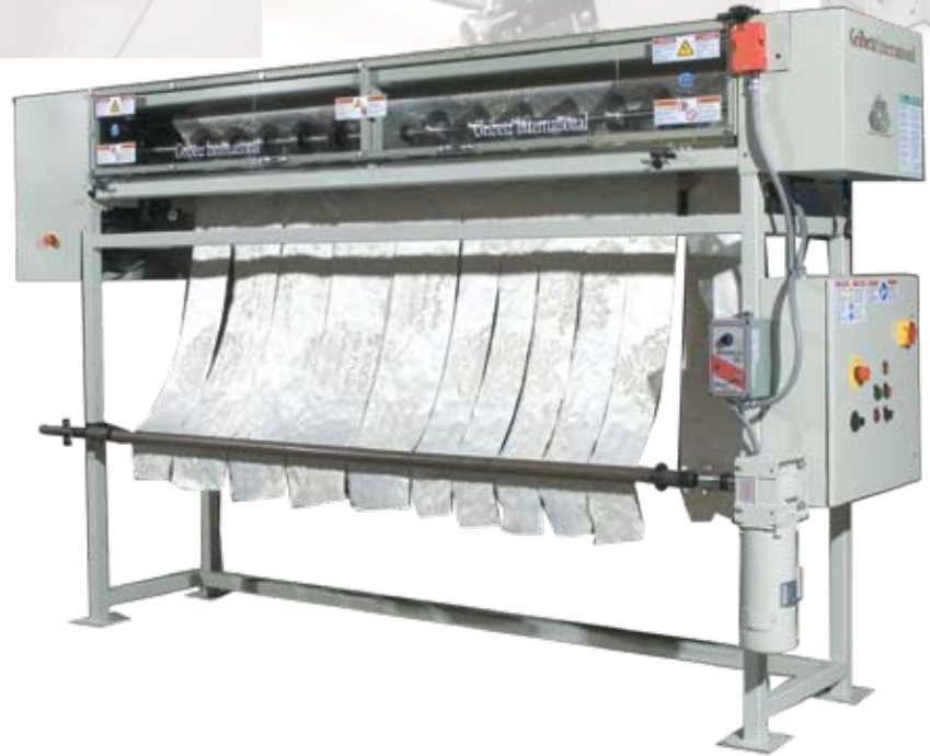
BSAP Border Slitter All purpose border slitter