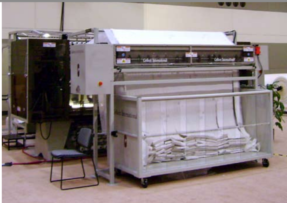
Shown here positioned behind a Legacy® quilt and feeding into a border cart, the BSAP is ideal for a mattress border work cell.